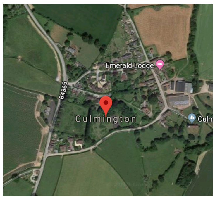
Fig 3: Culmington