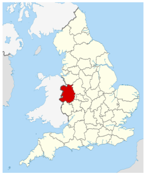
Fig 1: Shropshire