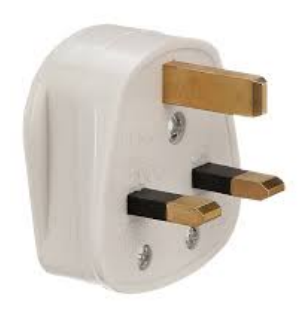
Fig 8: UK Plug

13 Amp 3 pin plugs are used in the UK, adapters are available.