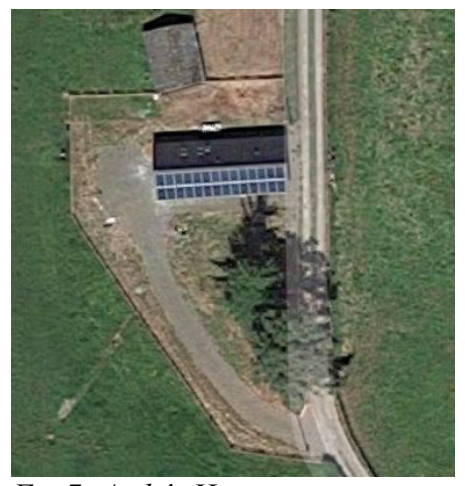
Fig 7: Andy's House

If there are less than about 20 attendees then it is proposed to use Andy's house in Seifton as a gathering point, this would be interleaved with the Discovery Centre in Craven Arms depending on what is happening. Access to the property is down a narrow farm track, past a small caravan site and over a ford. Parking at the house is limited and arrangements may be made for parking a couple of hundred metres away. There is space for an outdoor barbecue and, of course, WiFi. Plenty of options to play with solar, charge controllers etc.