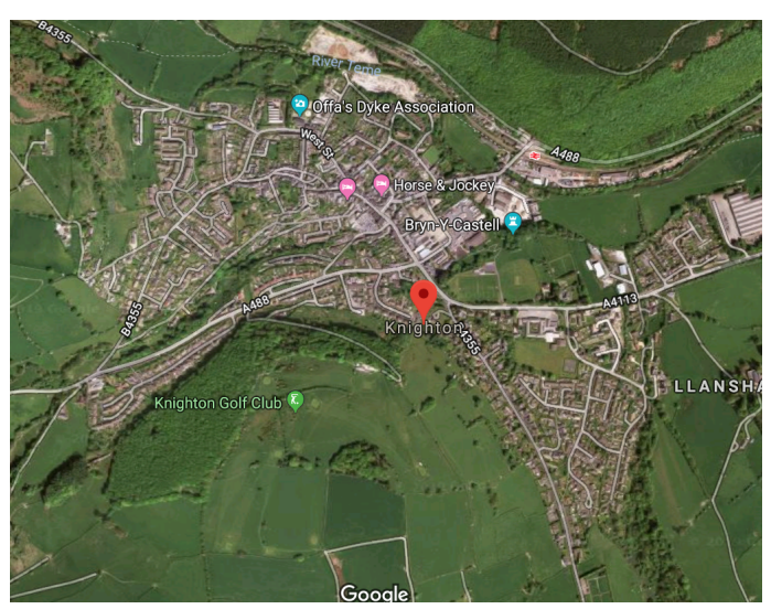
Fig 6: Knighton