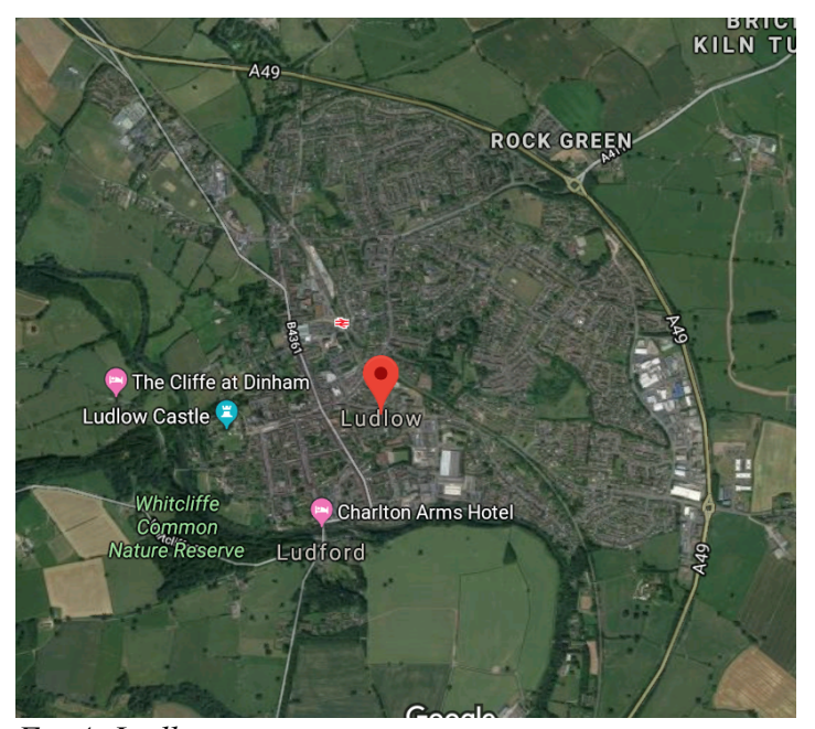
Fig 4: Ludlow

Ludlow contains a ruined castle and is known for its food and other attractions. There is a small market most days in the centre of the town. There is a rail station, Tesco and Aldi supermarkets near the centre. There are several ATM scattered throughout the town. Entertainment is limited in the town. There is Ludlow Brewing Company near the station who do tours, food and of course beer.