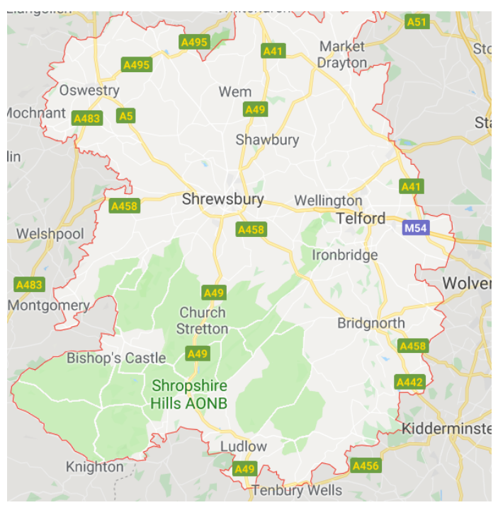
Fig 5: Shropshire

Circular walks are centred on the local towns and include The Mynd hill and Flounders Folly. There are many archaeological sites in the area. Walking route maps can be downloaded for free from "The Shropshire Great Outdoors" website.