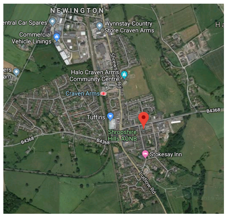
Fig 2: Craven Arms

Craven Arms is a central place for the LBW, it contains a railway station, the discovery centre, various shops, a few restaurants, a supermarket and some sites of interest. Most notable being "The Museum of Lost Content". There is some accommodation in the town. There is no longer a bank in the town but there are two ATM points, one inside the Tuffins supermarket and the second outside the post office next to the chip shop. Just down the road from Craven Arms is Stokesay Castle which is a fortified medieval manor house.